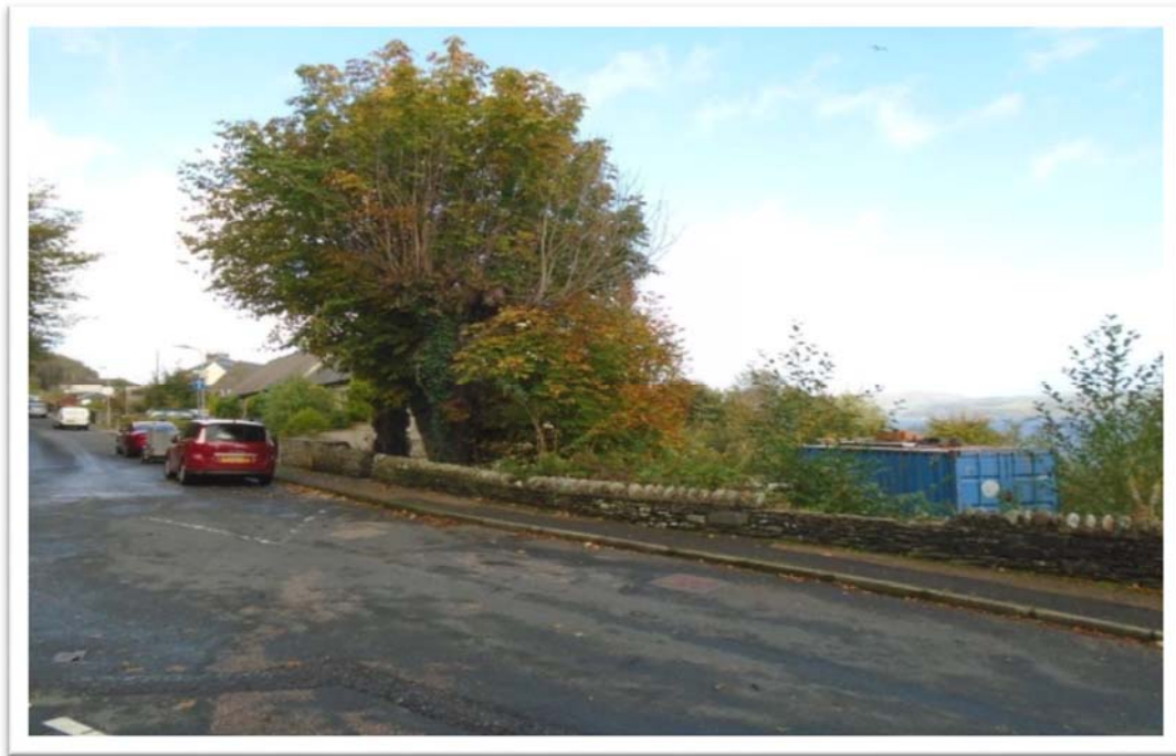
[Production No. 2 - photo taken 7 th October 2019 from top of Pier Road looking north-east over the appeal site]